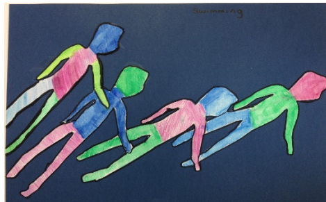
Ela 3DJ - Swimming