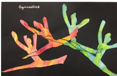
Levi 3/4W - Gymnastics