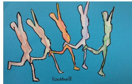
Jack 4RW - Football