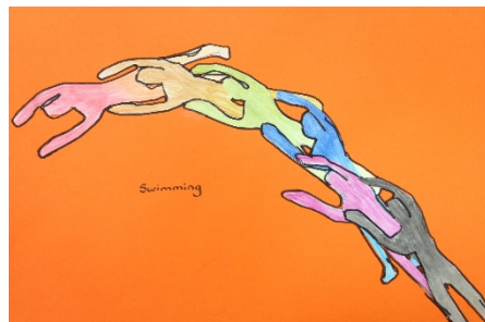
Chloe 4SB - Swimming