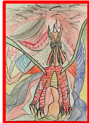
Subin 3/4W - Dragons