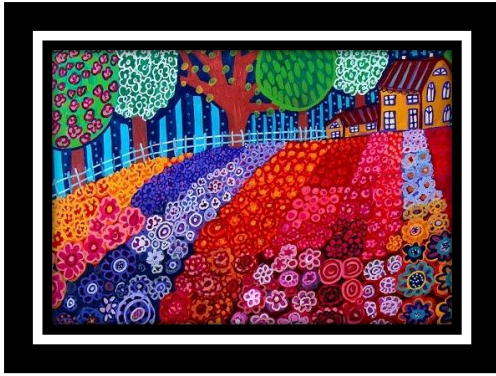
Heather Galler's Landscape painting