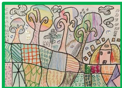
Anthony 3/4M - Landscapes