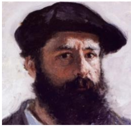
Claude Monet The Artist's Garden At Giverny. (1900)