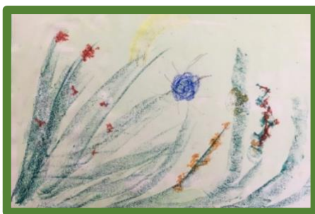
Elyse A. OSB