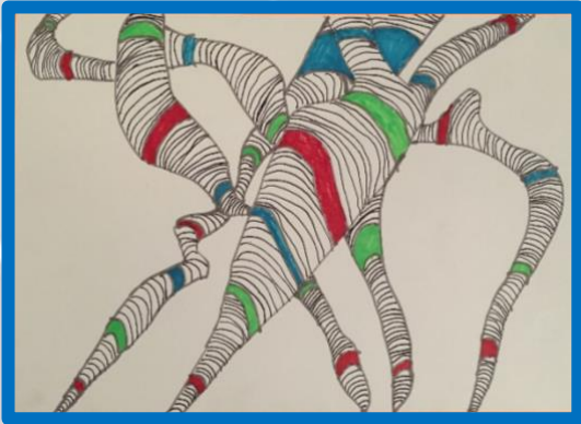
Tornado. Cameron 6BD