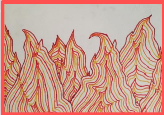
Bushfire. Cooper 5AH