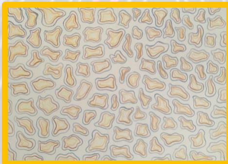
Drought. Summer 5/6H